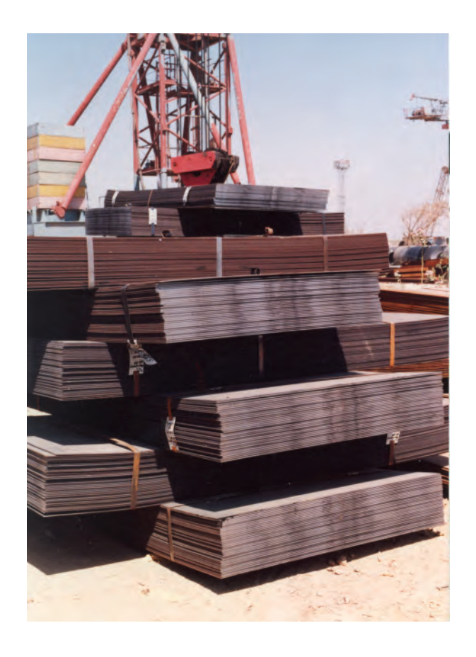
Photograph D for Question 4