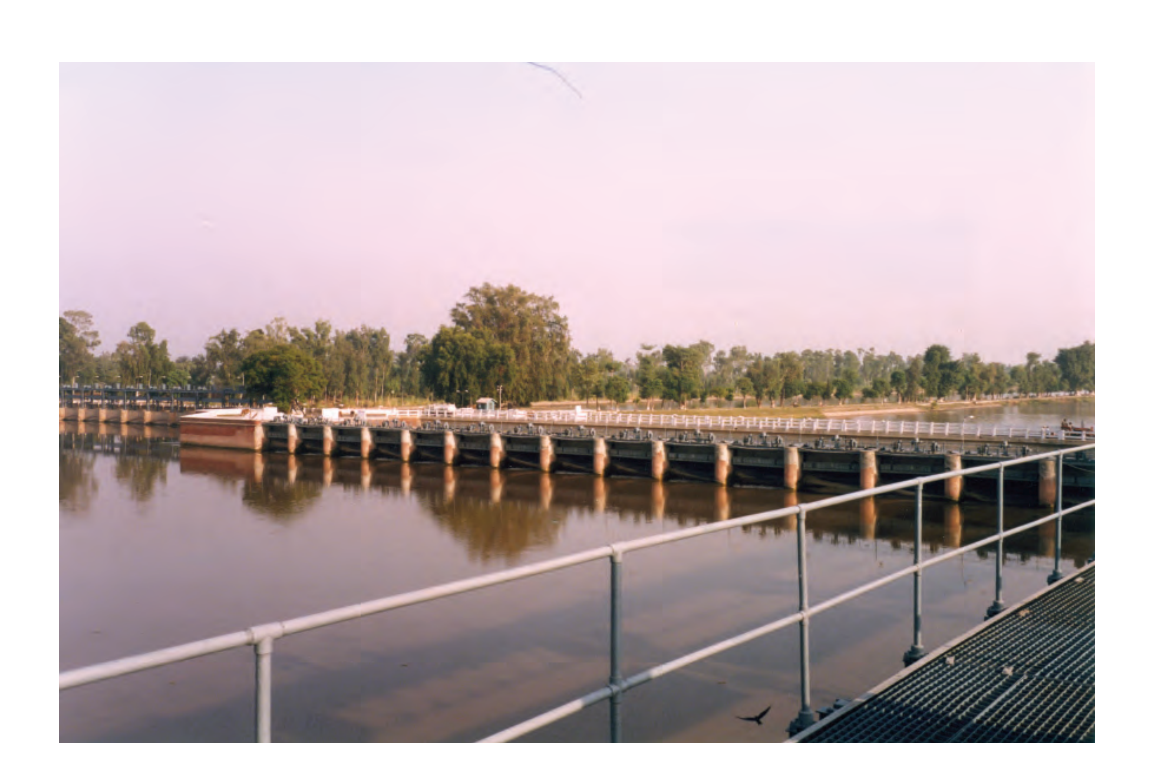
Photograph B for Question 1