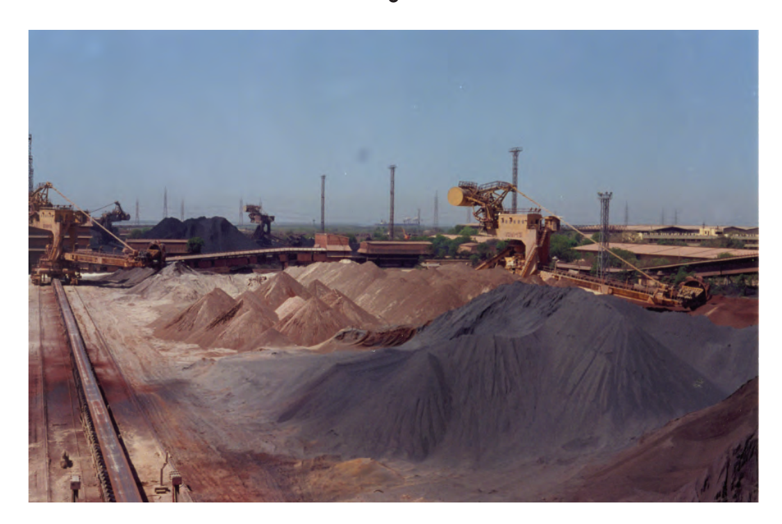
Photograph C for Question 4